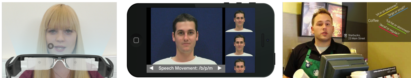
Figure 5. Left to right: PhonemeViz viewed through Epson Moverio glasses ( http://www.epson.com/moverio ) for ‘bat’, MirrorTrainer showing multiple words for the speech movement ‘p/b/m’ (images from vidTIMIT [45]), ContextCueView showing synthetic conversation cues for a coffee shop interaction using Google Glass ( https://developers.google.com/glass/ ).

tion diagrams help by prompting the speechreader to consider potential phrases and topics in advance of a given situation.